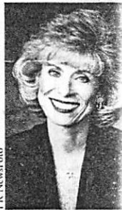
Dr. Laura Schlessinger

The authors suggest in considering non-coercive sex that: "A willing encounter with positive reactions would be labeled simply adult-child sex, a value-neutral term." One of the