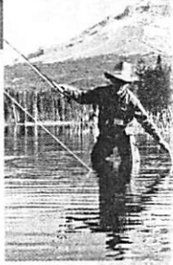
Lazy Days of Summer

Therefore I will look unto the LORD; I will wait for the God of my salvation: my God will hear me. —MICAH 7:7